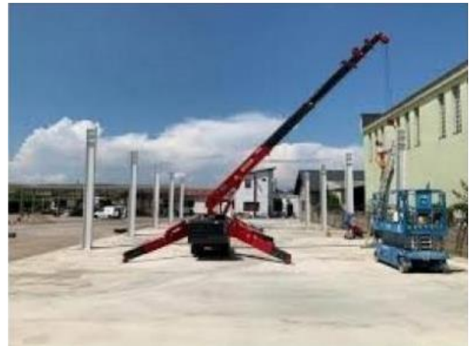
Fig. 1. Small low floor building crane

The building lift [1] is a stationary lift up driver which carry load in height only and requires floor frames.